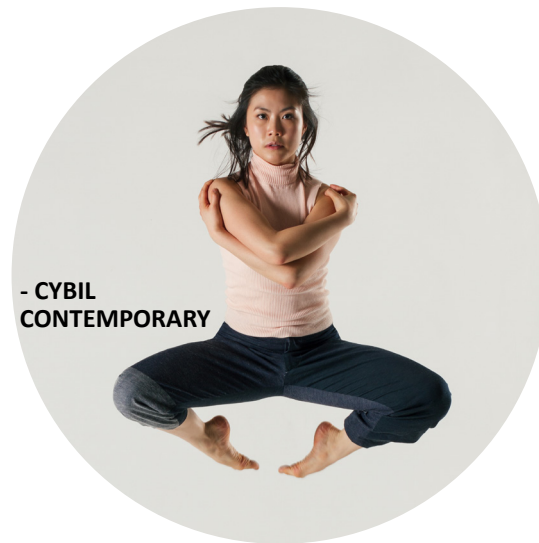
- CYBIL CONTEMPORARY

Once you have grasped the basics, you may want to refine your technique, speed up your learning and ask more specific questions that can only be addressed in private lessons. To arrange, please send an email to info@dancetrinity.com with your request.