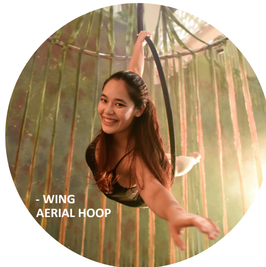
- WING AERIAL HOOP

Once you have grasped the basics, you may want to refine your technique, speed up your learning and ask more specific questions that can only be addressed in private lessons. To arrange, please send an email to info@dancetrinity.com with your request.